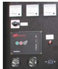
Analog Control Panel